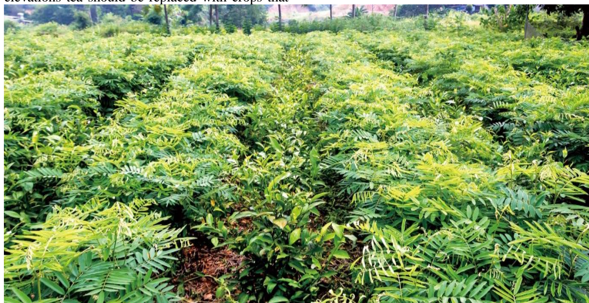
Figure 5. Young tea plants intercropped with Tephrosia candida

Finally, this paper argues for the reduction of tea produced as a monoculture. Intercropping tea with nitrogen-fixing crops would provide one part of the solution to climate change. In particular, Popcorn cassia is known to advantageously provide shade through its canopy and improve soil quality. It has also been recommended by extension agencies in the past. However, further research is needed as to its suitability and the specific adaptation of this plant to local conditions. While no academic research was found that supported these claims, some farmers believe Popcorn cassia has a tendency to harbor pests and/or compete with tea for nutrients. As an alternative, tea farmers preferred planting Tephrosia candida to provide shade to their tea farms and improve the soil (Figure 5).