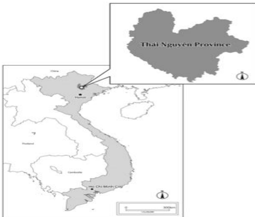
Figure 1. Map of Vietnam with Thai Nguyen Province

Thai Nguyen Province is located approximately 80 kilometers from Hanoi in the north of Vietnam (See Figure 1).