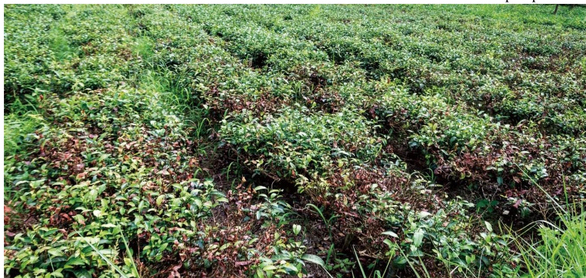
Figure 4. Damaged tea as a result of a combination of increased precipitation followed by high temperatures

The third major change is the more frequent periods of severely high temperatures. High temperatures burn both tea buds and young leaves. Tea propagated by fasciculated roots, such as is common with hybrids varieties, are particularly vulnerable. During fieldwork in the summer of 2017, the region experienced long periods of heavy rain combined with temperatures over 37 °C. Respondents noted that tea roots appeared “cooked” (Figure 4). The percentage of damage (i.e., defoliation and/or death) and loss (harvest rounds missed) ranged from 20% in more sloped areas to 70% in flat areas. Finally, the rise in temperatures has resulted in an increase in insect pest pressure.