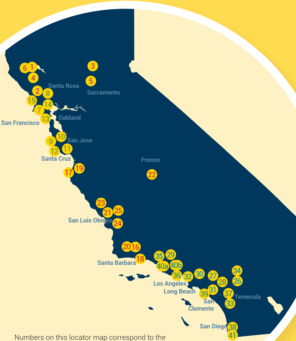
Numbers on this locator map correspond to the numbered farms in the Table of Contents.