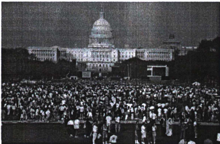
Crowd of People at Washington Mall for the Names Project AIDS Memorial Quilt, Washington DC.

The United States has the third-largest population in the world (after China and India). In 1990, population in the United States passed the 250,000,000 mark. Who are the American people?