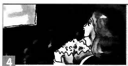
4 once a week / watch a film at the cinema