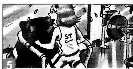
5 rarely / go to the gym