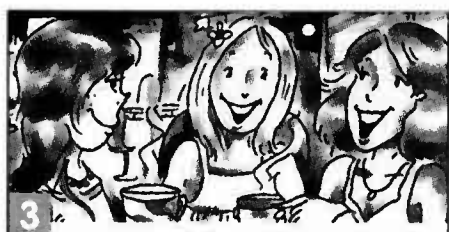
3 in the evening / usually / meet her friends for coffee