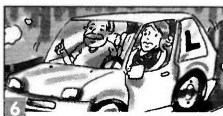
6 have a driving lesson / twice a week